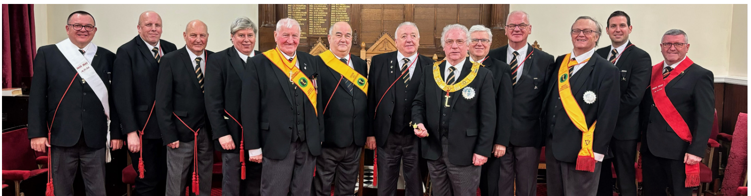
Candidates for Preparation and the Provincial rulers