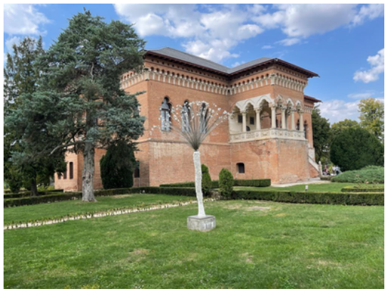
On 01 October, the participants concluded the series of events on the occasion of the First district Annual Communication with a tour of Bucharest followed by a visit to the Palace from Mogosoaia and the Snagov Monastery.