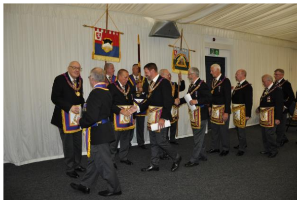
The Brethren of the Mark Province of Kent and their guests then retired to the bar. There were many guests from other Provinces, such as Kent, Middlesex.