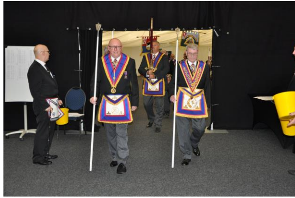
Greeting their honoured guests as they left.