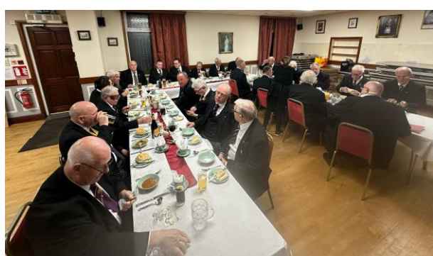
Aberteifi Conclave No. 397 Enthronement Assembly held at the Masonic Hall Napier Street Cardigan 25 October 2023