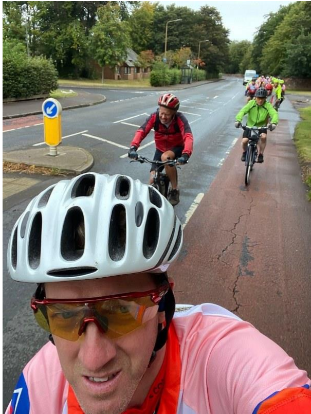
6 - Almost home