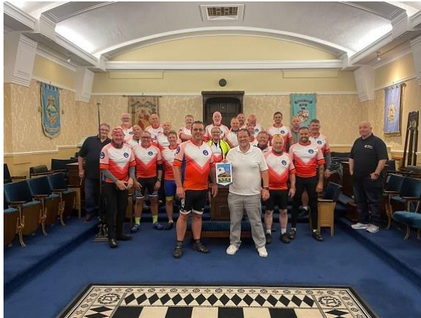
16 - Sharing the goodwill