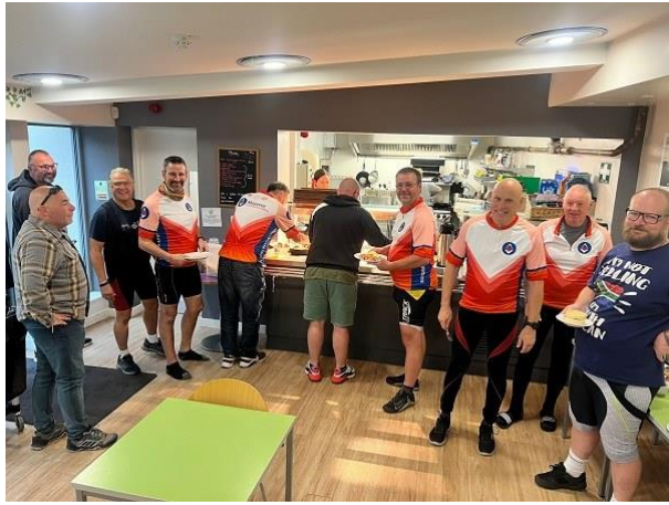
10 - Cram in the carbs lads