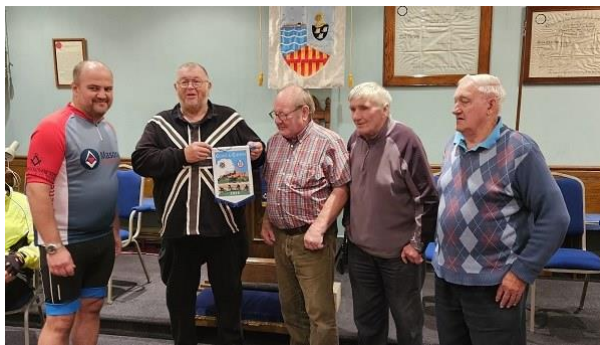
17 - Thanks for the hospitality