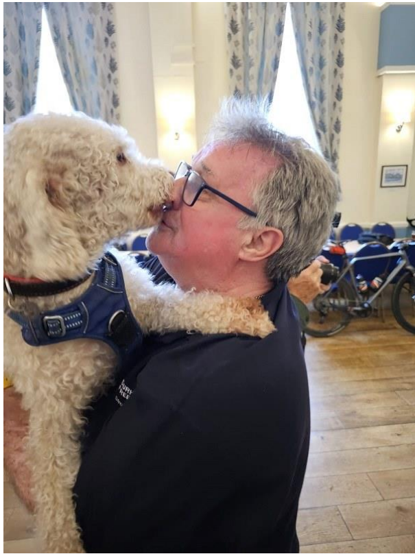
9 - A fluffy welcome home