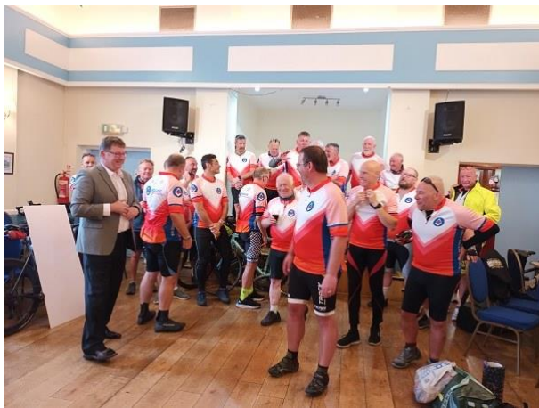
11 - Finish venue