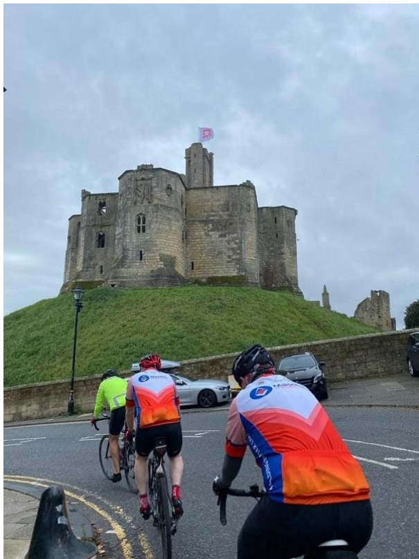
15 - No time for sightseeing