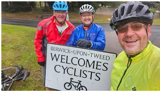
14 - Just a little wet