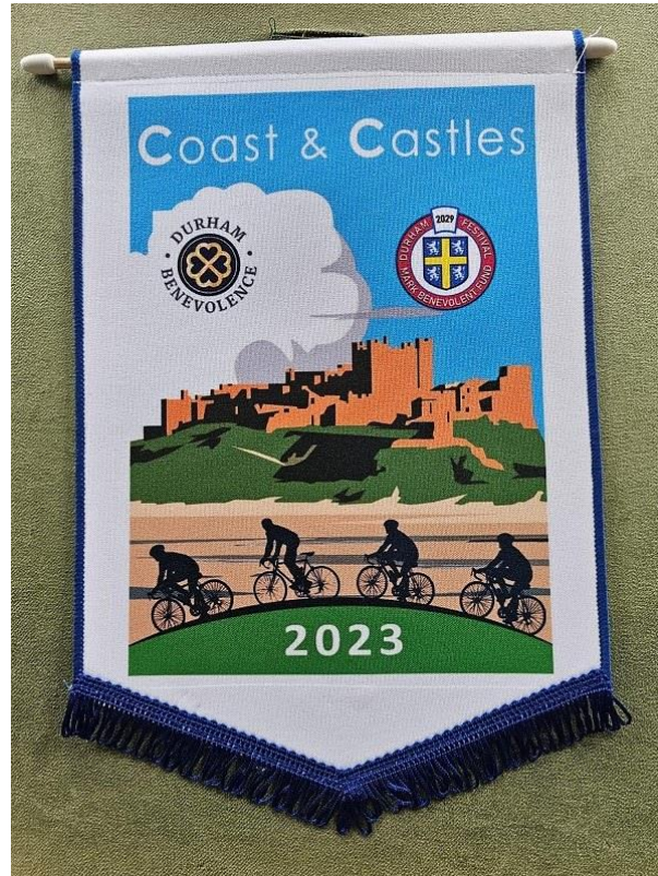
5 - The banner