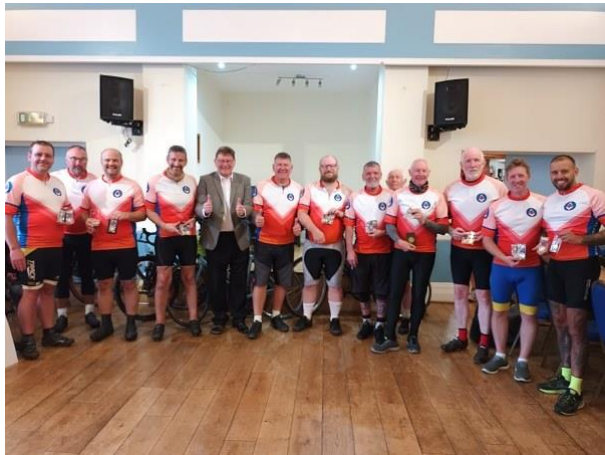
12 - Festival jewels