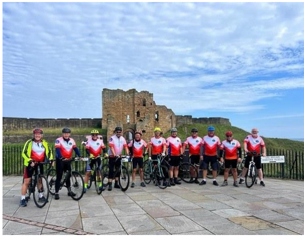
7 - Better weather