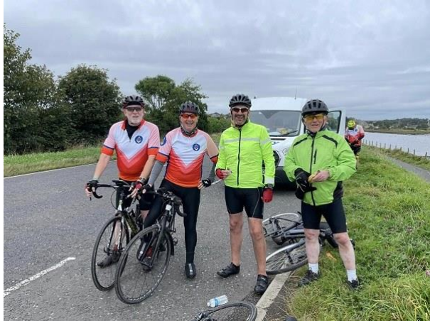
8 - A quick stop