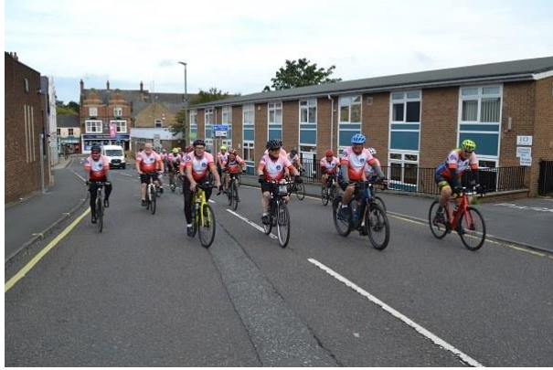
13 - Home at last