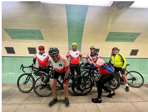
3 - Tyne tunnel

Sunday dawned brighter and drier! The final leg saw them take in a much-needed lunch at Blyth Masonic Hall again provided by the local Freemasons. The route took them under the River Tyne, using the pedestrian tunnel which runs along side the vehicular tunnels.