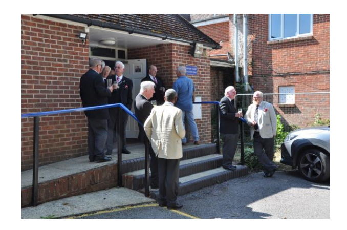
...we were called in to lunch.