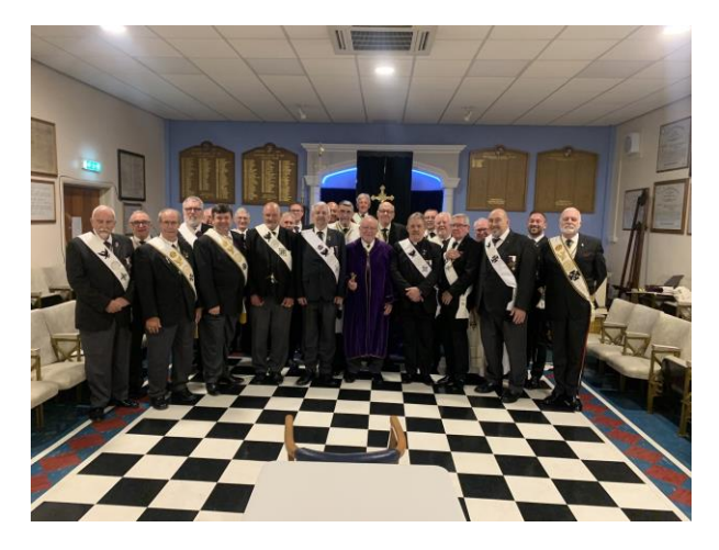
5 - The Divisional Team who were involved in putting on the ceremony

This was a big night for the Intendent-General and Divisional Marshal as it was their first time in charge of installing Knights of the Red Cross into the Holy Order of St. John the Evangelist and of the Noble & Invincible Order of the Holy Sepulchre and overseeing the ceremony, which lasts for almost 2 hours and requires a considerable team of knights from the Division, including members of the Divisional Sepulchre Guard to ensure that it is properly carried out and, to add to the intricacies of the evening, it was the first time that this location had been used.