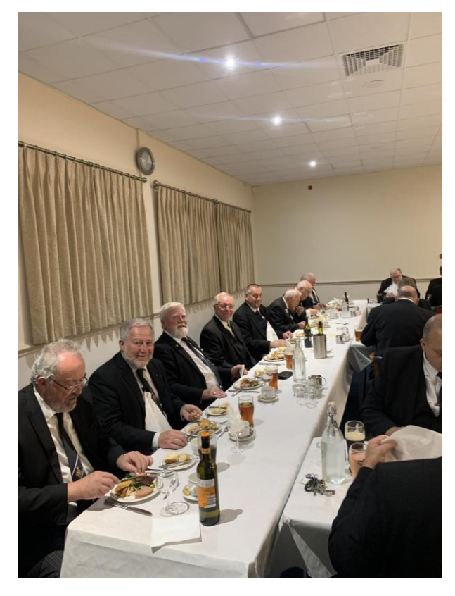
7 - The top table at the Festive Board clearly enjoying themselves

The meeting was followed by a most enjoyable Festive Board with some of the finest catering that any of the Masonic Centres in Kent can provide, and concluded, after all the normal toasts, with a toast by the acting Most Puissant Sovereign to the new knights who encouraged them to get fully involved in the Order and the Division, and then asked all the assembled knights to rise and give them a very warm welcome into the Orders of St. John the Evangelist and of the Noble and Invincible Order of the Holy Sepulchre, which was done with much enthusiasm and gusto.