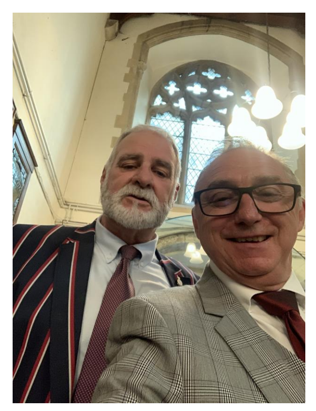
3 - The Divisional Marshal wearing a very natty jacket, together with the Divisional Warden of Regalia wondering where he can get one!

After the ceremony, the assembled congregation enjoyed tea & coffee provided by the ladies of the church, whilst those requiring something a little bit stronger repaired to the King & Queen public house opposite.