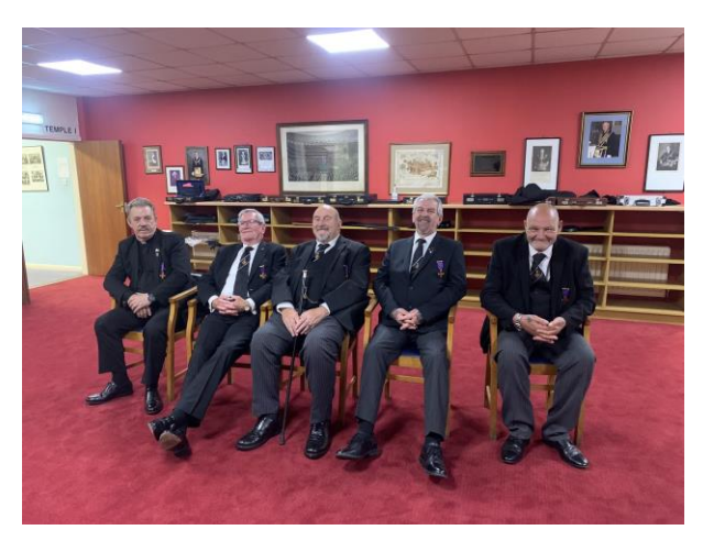
4 - Candidates prior to the meeting

Less then 24 hours later the Division was back on duty to undertake the Appendant Orders for 5 new knights who had recently joined the Order.