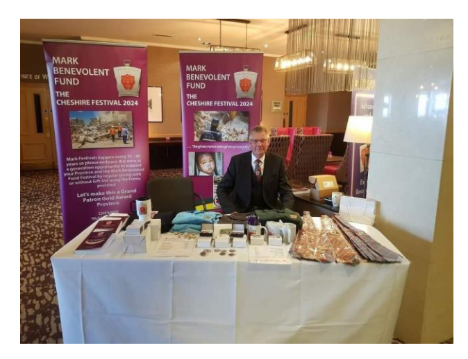
6 - including a Festive Tie