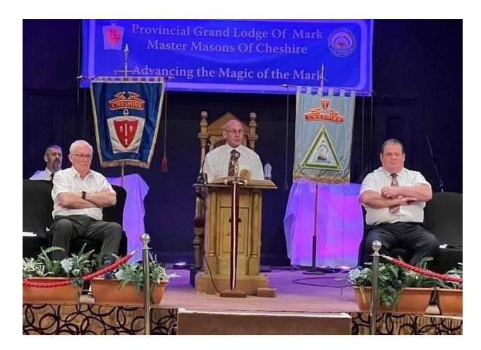
4 - Preparations are well underway at the Chester Crowne Plaza Hotel