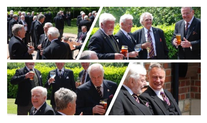
13 - Taking advantage of the lovely weather between the meeting and the Festive Board