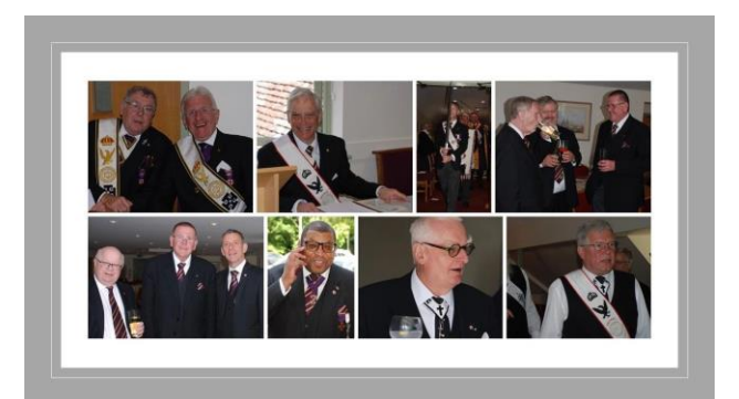
14 - Some of our Divisional Knights