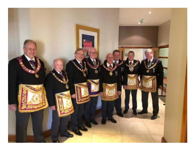
8 - Waiting to be received