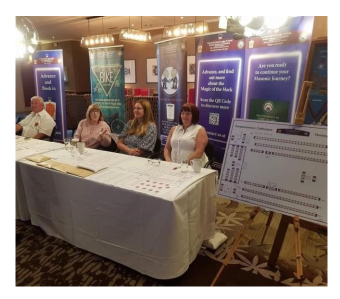
5 - A warm welcome and a chance to purchase an array of Festive merchandise