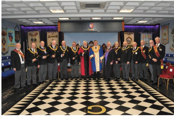
And Heads of other Orders in Sussex.