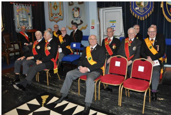
Once everyone was seated in the Temple, Companions were called to order to receive the Right Distinguished Companions.