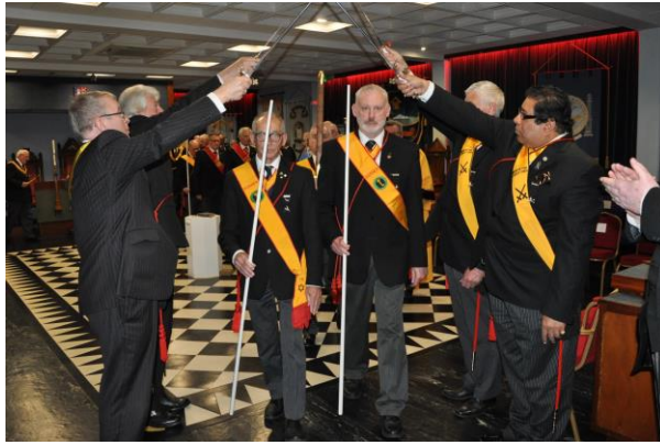
Greeting their guests on the way out.