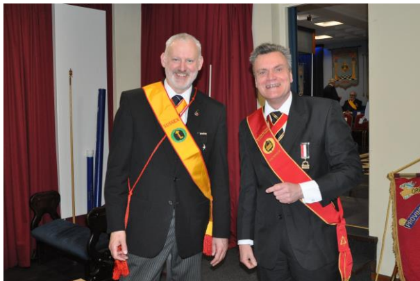
There were honoured guests from many Provinces.