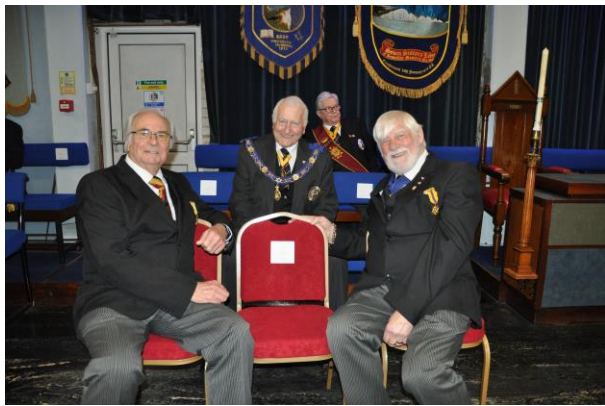
The Brethren were called to order to receive the Right Worthy Brethren.