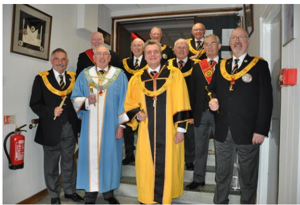
And Heads of other Orders in Sussex.