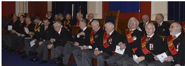
5 - Some of the Founders of the new Consistory