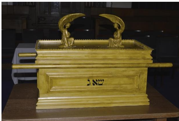
7 - Symbol of the Order