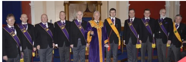
9 - The Grand Summus with his Grand Tzaddikim