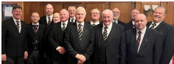
12 - Durham & Northumberland Contingent (less one) with the Grand Summus