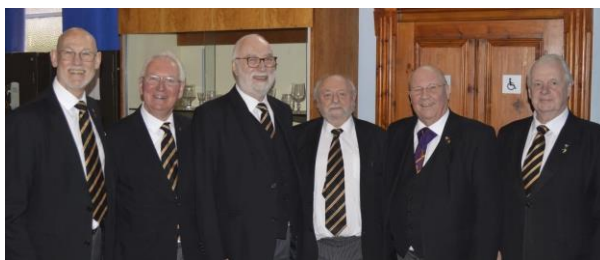
13 - Surrey Companions