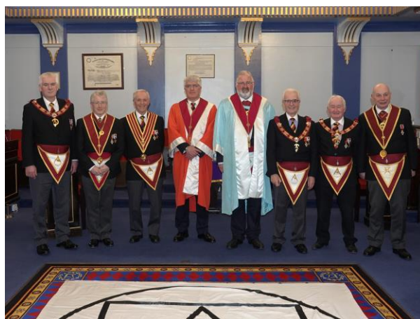
1 - St Cuthberts Council Officers meets his Distinguished guests;

The Council then proceeded to perform the Select Master degree with 3 chosen candidates in what can only be described as a “near perfect ceremony”.