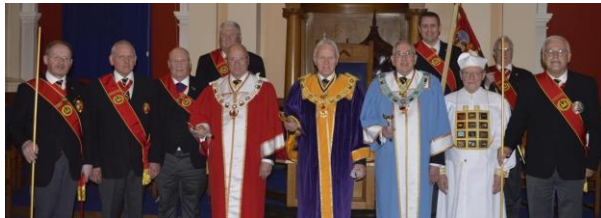
6 - The Grand Summus and Consecration Team