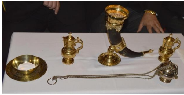
8 - Consecration Vessels