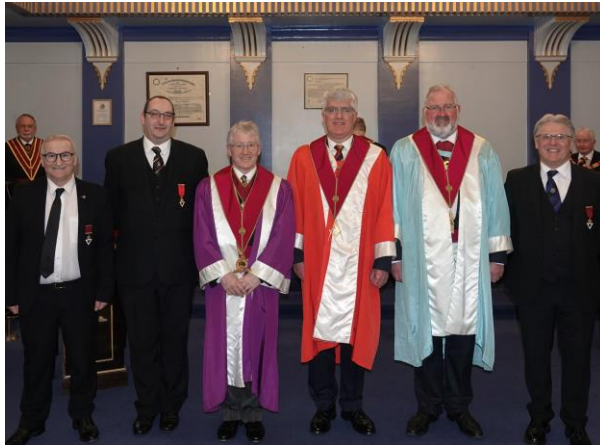
2 - New Candidates at St Cuthberts Council No. 181 - the T.I.M. with his D.M., P.C.W., and 3 Candidates

The evening concluded at the Festive board where a super meal was well served, and all of the usual toasts were delivered and replied to.