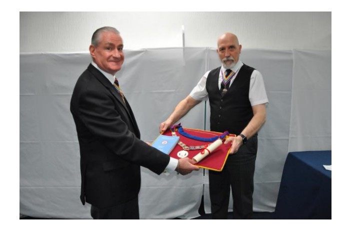
There were many guests from Kent