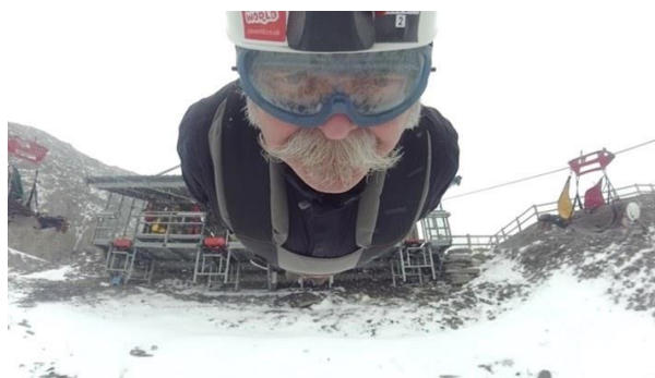
2 - No going back now!