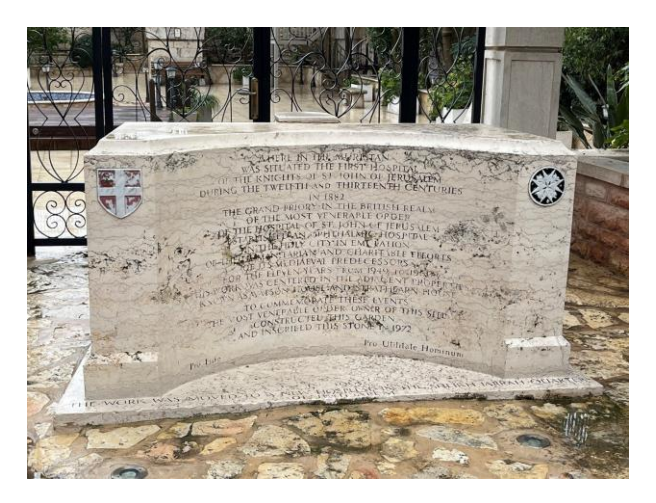
11 - Entrance to the Muristan Clinic and Peace Garden

working anywhere else. Their dedication to providing the highest possible standard of treatment to all who needed it was truly humbling to see, and a reminder, if one was needed, of the positive impact and huge benefit of the donations made by Brother Knights in support of this truly remarkable institution.