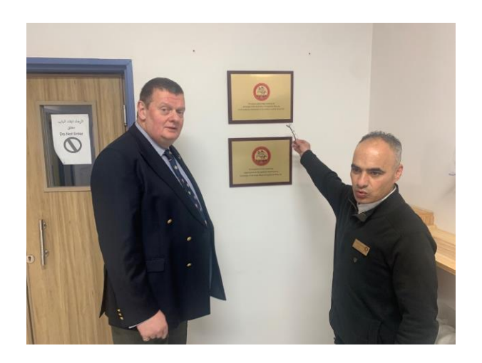
14 - Recognition of Great Priory Donations