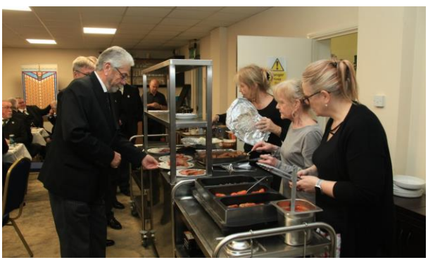
3 - The Prov.G.M. pulling rank and first in line for breakfast