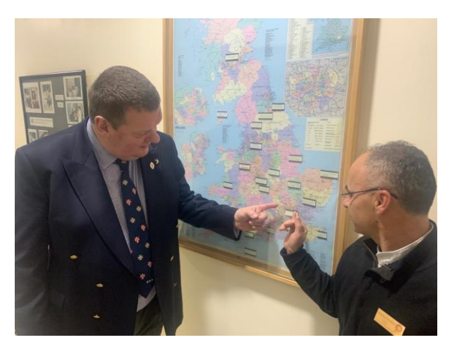
19 - Pointing out Hertfordshire on the map