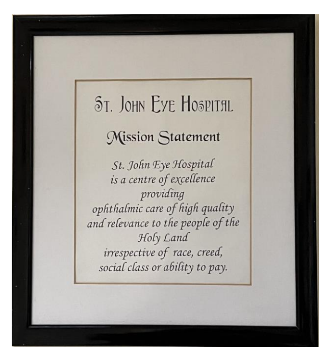
15 - Mission Statement