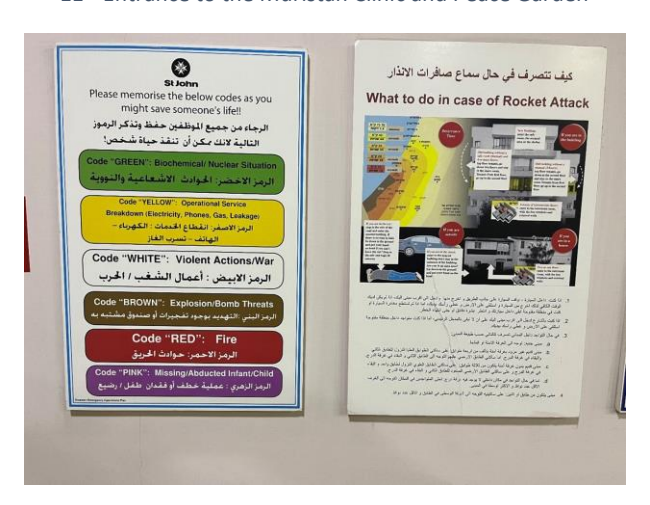
12 - Emergency Actions