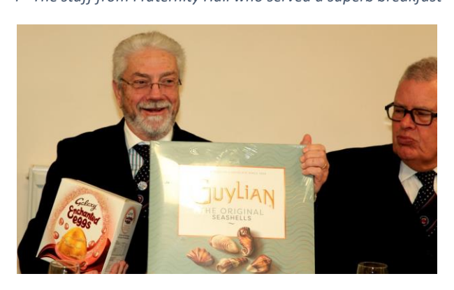
\it 5 - The "winnings" from the raffle.. Honest!!