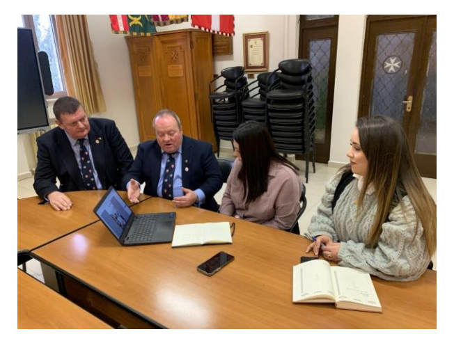
16 - R.E.Kt White and E.Kt. King meeting with the Communications Team