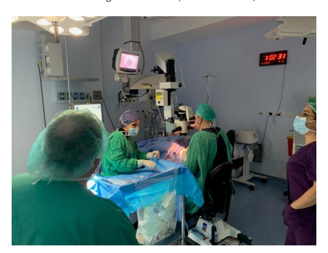
18 - Cataract Surgery in progress