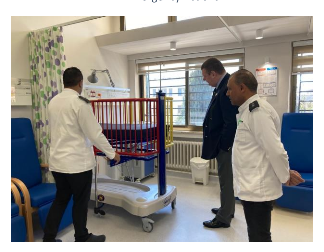
13 - Refurbished Pediatric Ward