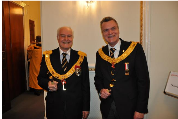
The Companions were called to Order to receive the Right Distinguished Provincial Grand Summus who entered the Temple in procession, accompanied by the Provincial Grand Officers of the Year.