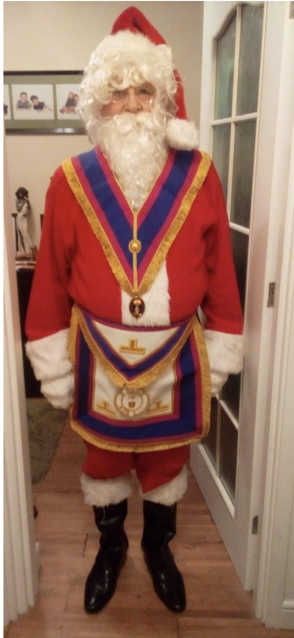
4 - Father Christmas the Mark Man