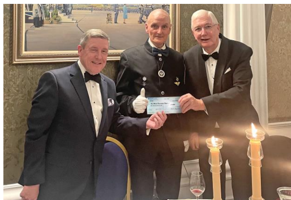
6 - The 'Three Wise Men', aka the Grand Secretary, the CO, and the Prov.G.M. for Surrey, with the cheque for the MBF