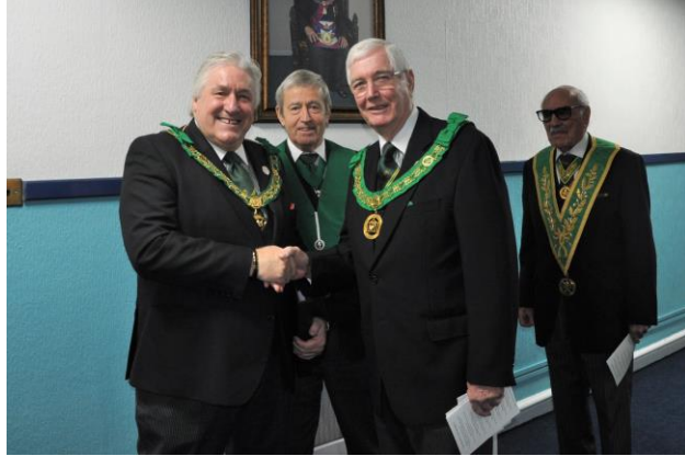
After refreshments in the bar...