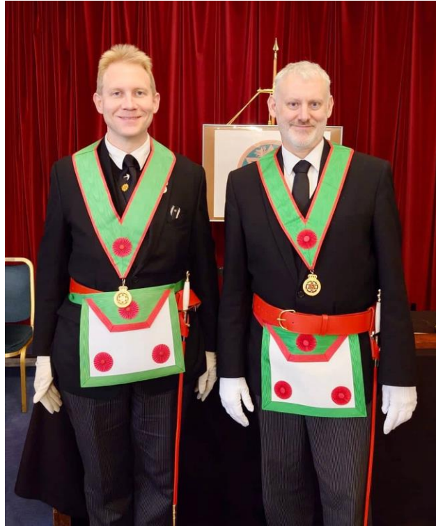
Information provided by the "Knights of the Vision Beautiful".