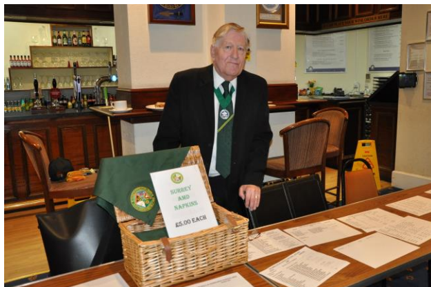
... with some success. The napkins are worn by Surrey AMD Brethren at Surrey Mark festive boards, to promote our wonderful Order.