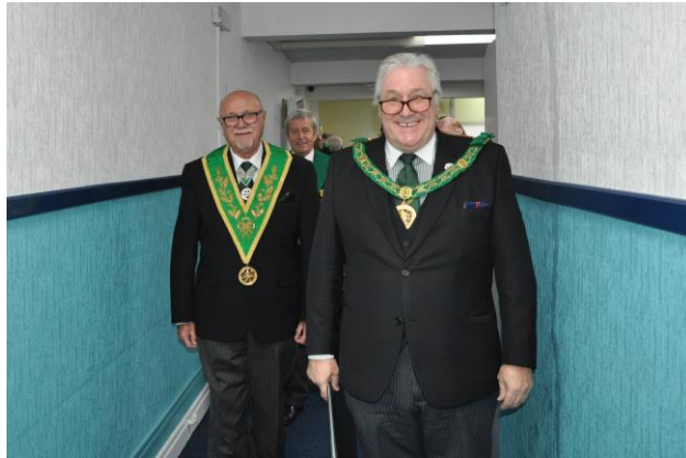
Greeting everyone on their way out from the Temple.