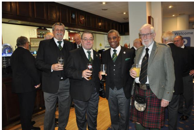
... the Brethren of the District Grand Council of Surrey and their guests sat down to a splendid lunch at the Croydon Masonic Halls.