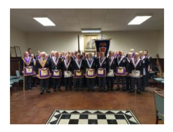
Happy 100th to Wyre Lodge of Mark Master Masons. No. 754