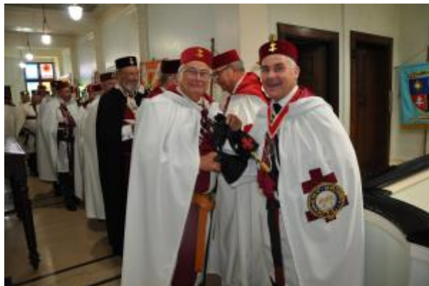
Afterwards the new Provincial Prior posed for a photograph with the Installing Officer and his Assisting Officers....