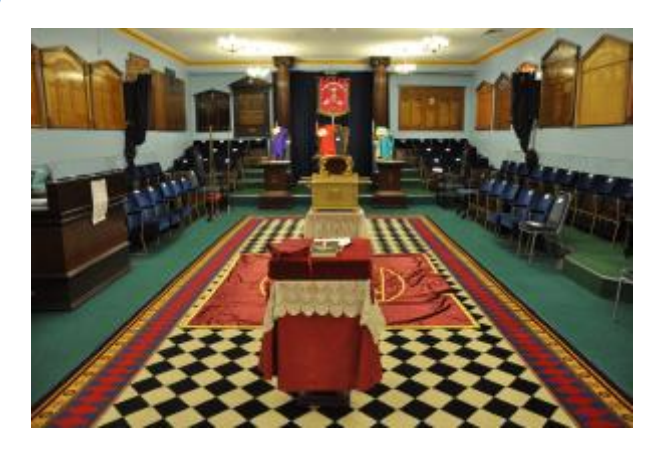
Saturday, 27 August 2022 was the date of the Annual Meeting of the District Grand Council of Dorset, Hampshire & Isle of Wight.

Companions from across the Constitution met up in the bar for coffee and a chat before getting ready for the meeting.