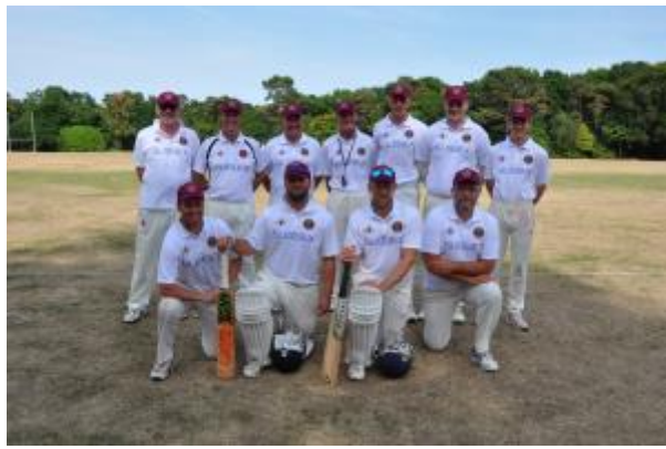
And of course, the winners, Kent.