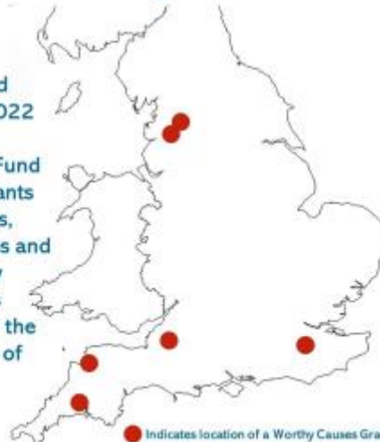
● Indicates location of a Worthy Causes Grant

In the second quarter of 2022 the Mark Benevolent Fund made 17 Grants to individuals, local charities and other worthy cause across England and the Inspectorate of Romania.