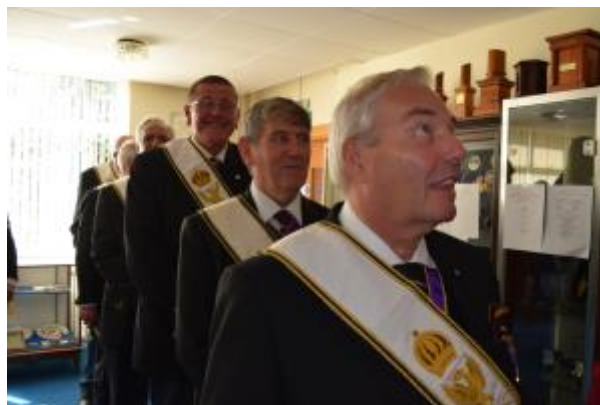
1 - The visiting Is-G prepare to make their entrance

R.III.Kt. Denis opened the Middlesex Divisional Meeting and welcomed no fewer than ten visiting Intendants-General.