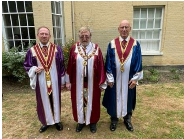
1 - The Dist.G.M., Dep.Dist.G.M., and Dist.G.P.C.W.

After a brief Address from the District Grand Master the meeting was closed and the Companions retired to enjoy an excellent festive board.