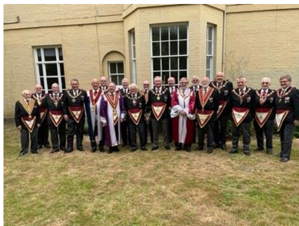
3 - The District Officers, R.III.Comp.s and honoured guests