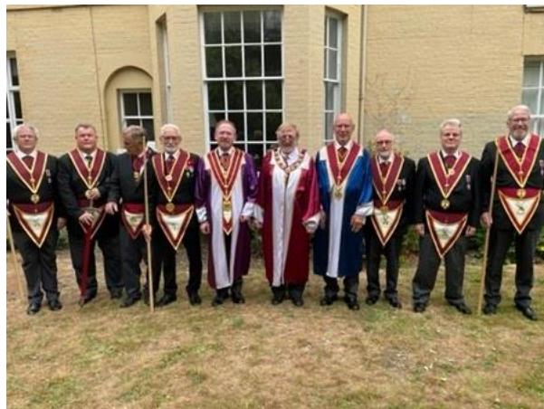
2 - The District Officers