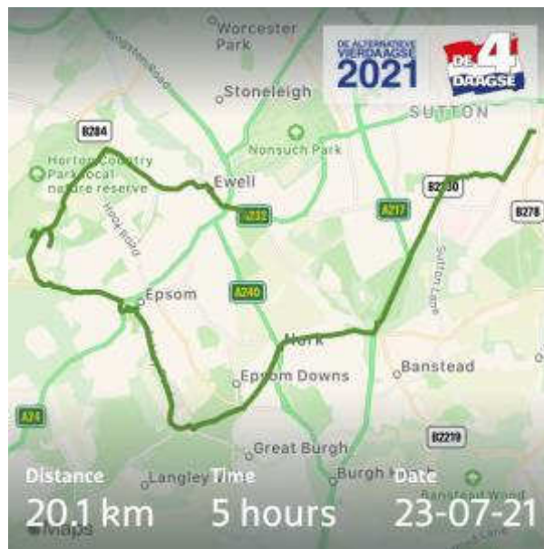
9 - Carshalton, Belmont, Drift Bridge, Epsom Racecourse, Horton Park, Ewell and home