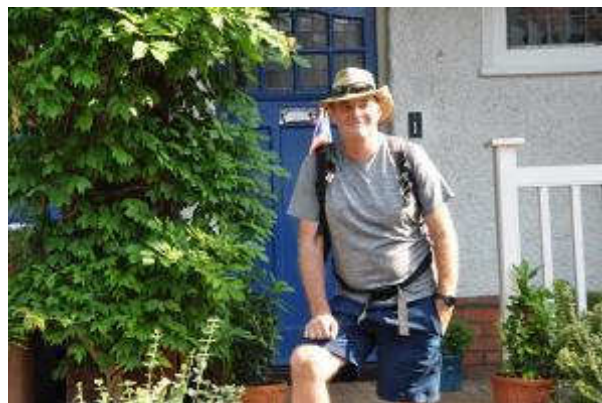
5 - Finished Day 2 of the Alternative Nijmegen 2021. Another scorcher!