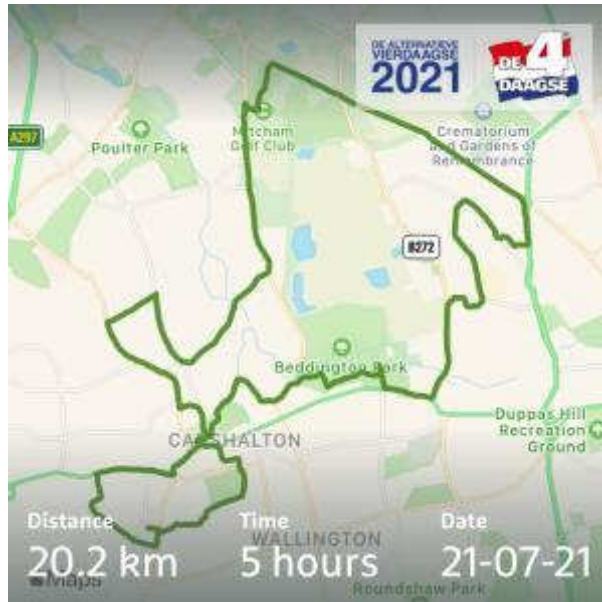
4 - Today it's Carshalton, Beddington, Purley Way, Mitcham and home