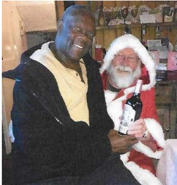
1 - And sometimes, even Santa gets to meet Santa.