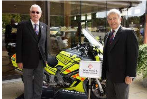
5 - The MBF Blood Bike Presentation event and the Surrey Mark team.