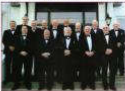
Provincial Grand Lodge of Mark Master Masons of Surrey website: http://www.masonsofsurrey.org.uk/

After the business of the Coaches had been completed the Presiding Officer thanked everyone for attending a most enjoyable meeting and declared the meeting closed.