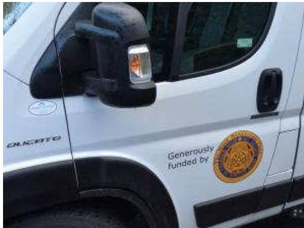
The Red Cross Division on Lincolnshire make £2,500 Presentation