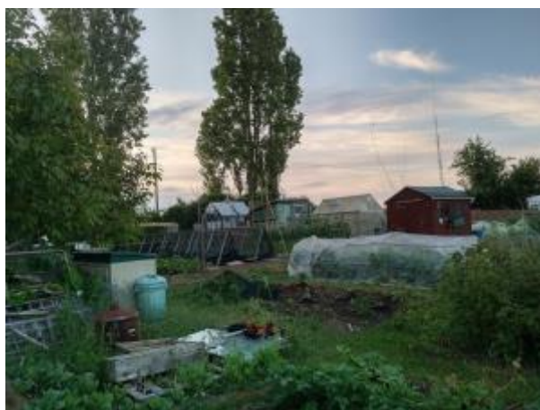
1 - Last to leave the allotment

We look forward to receiving your entries. Below are some pictures which may provide inspiration.