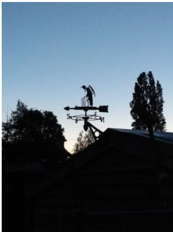
5 - Waiting for play to resume