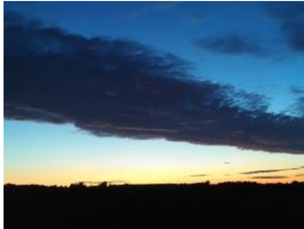
7 - No vapour trails