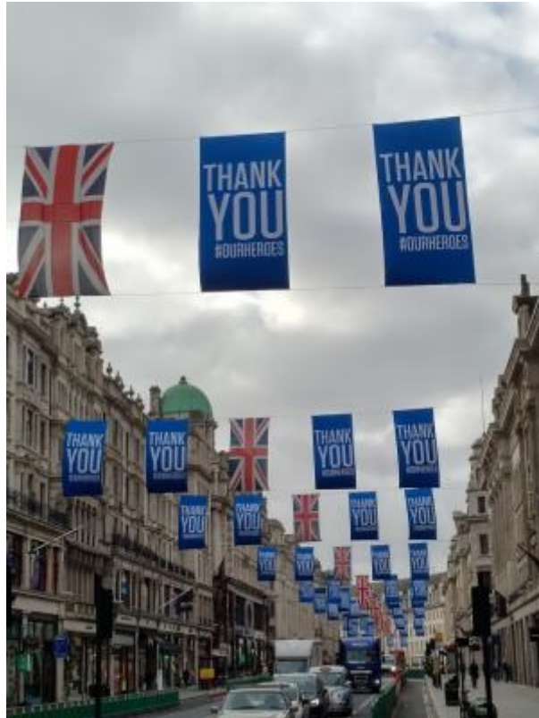
2 - Flying the Flag