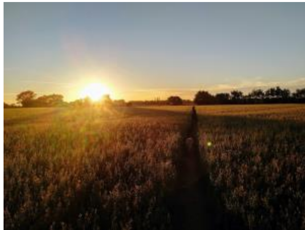
3 - Tranquil Sunset