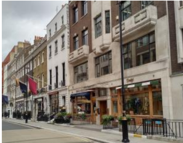
4 - All's quiet on Savile Row