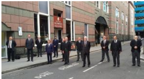
6 - First time out