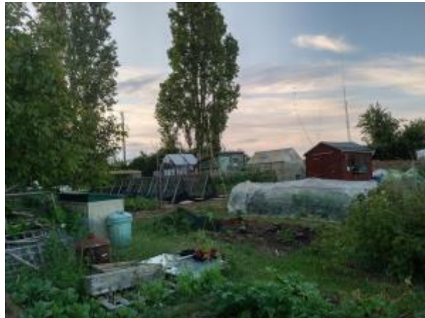
1 - Last to leave the allotment

We look forward to receiving your entries. Below are some pictures which may provide inspiration.