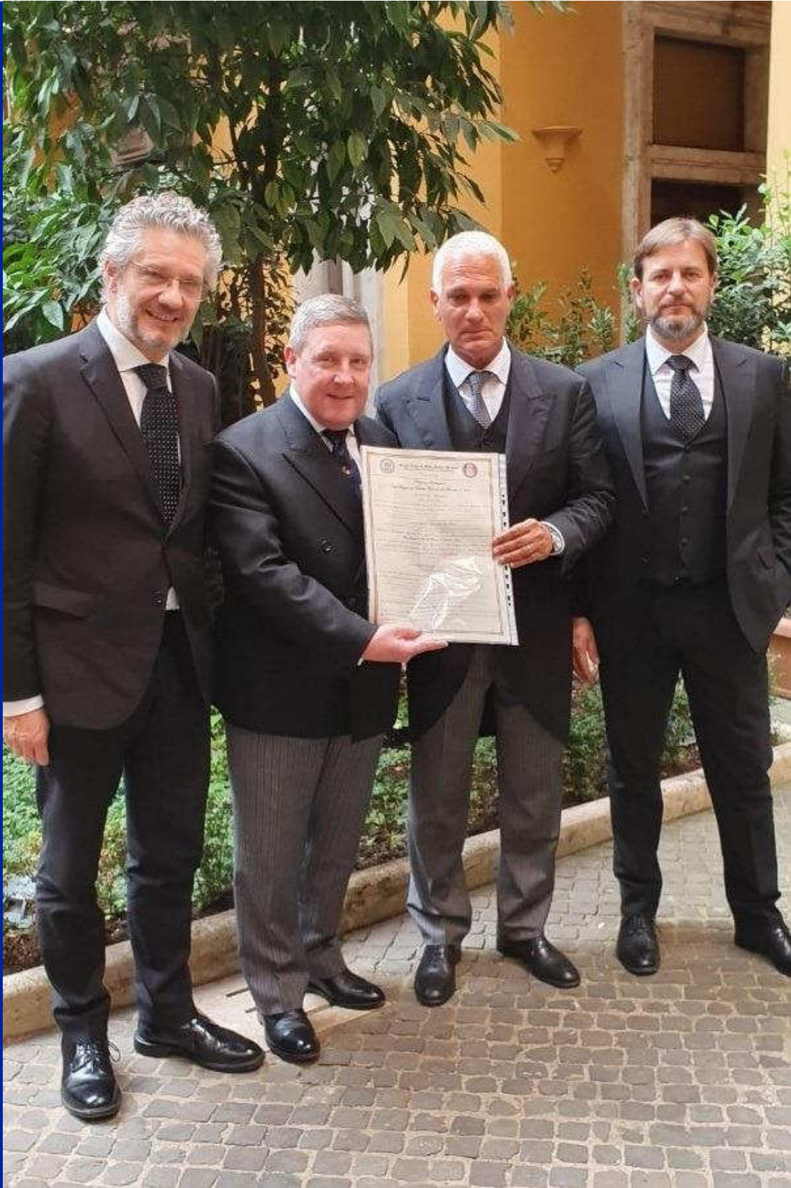
When in Rome .....