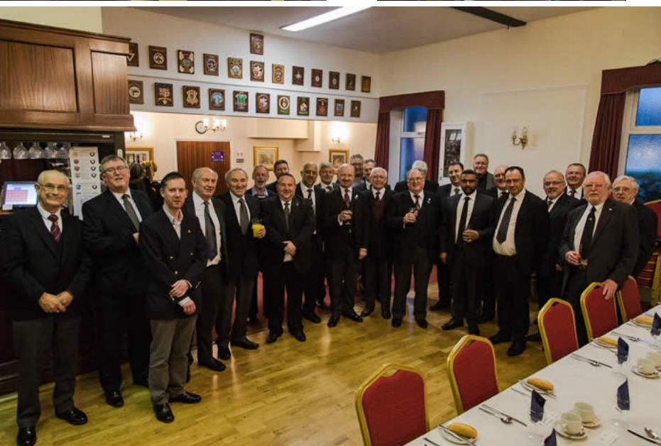
On talking to the 22 non-mark masons all seemed to enjoy the evening and it clearly stimulated a number of them to consider joining the degree. At least two application forms where completed on the evening and there have been a few more since.

We all then dined in a most convivial manner.