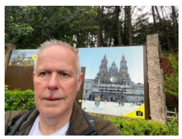
{\it With\ thanks\ to\ E.Kt.\ Angus\ Rhodes,\ Gt.\ Capt.\ Gds.}