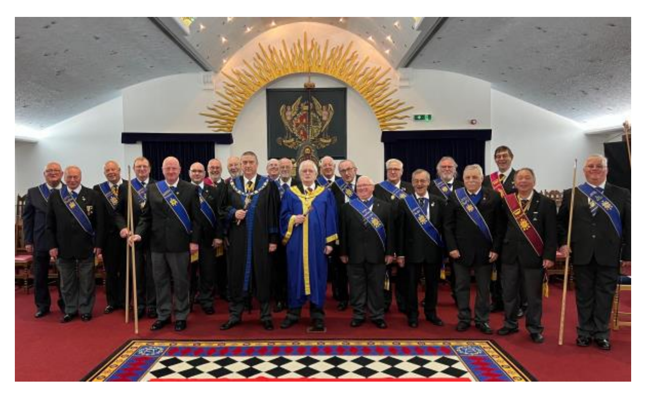
2 - The new Provincial Team, OSM Cheshire & North Wales