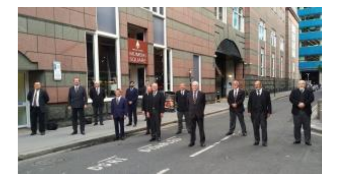
6 - First time out