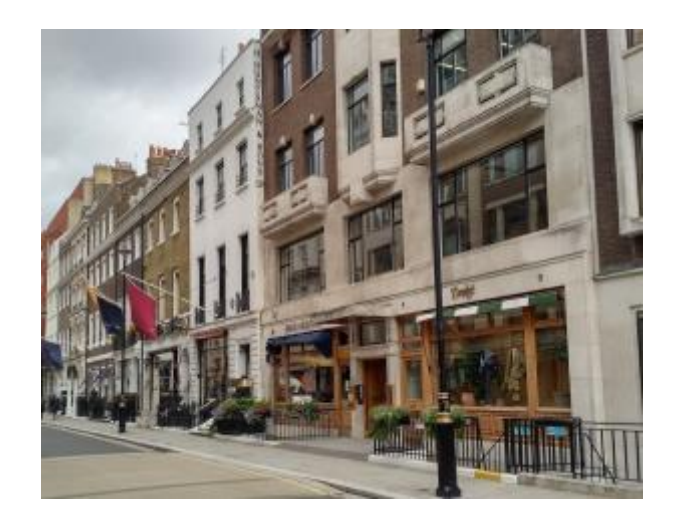
4 - All's quiet on Savile Row