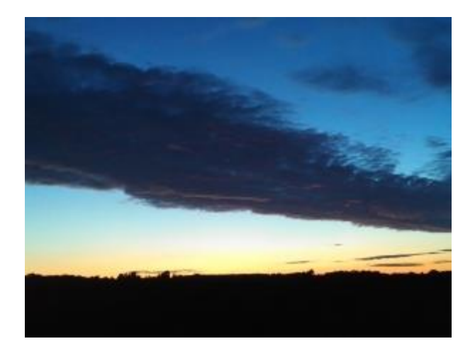
7 - No vapour trails