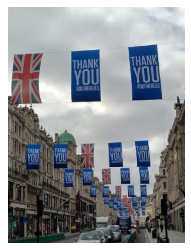
2 - Flying the Flag