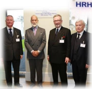
HRH Prince Michael of Kent Room

The complex houses 10 ensuite bedrooms for the children and 2 specially self-contained flats for the use of parents and carers. Last month our Grand Master, M.W.Bro. H.R.H. Prince Michael of Kent, GCVO, opened the new centre and met with centre staff and trustees from the Mark Benevolent Fund.